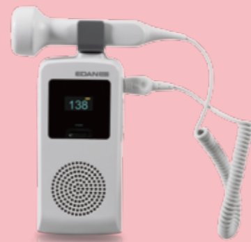
SD3 Ultrasonic Pocket Doppler