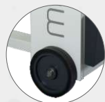
Big Rear Wheel