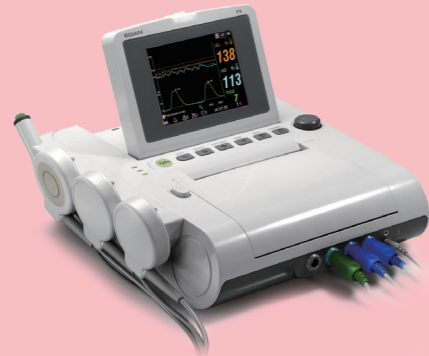
F3 Fetal Monitor