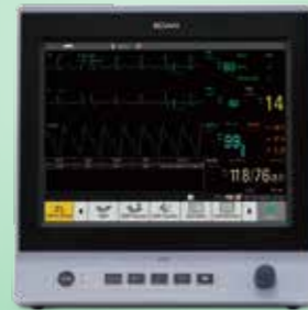
X12 Patient Monitor