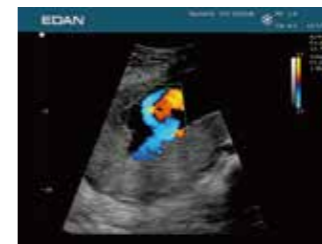
Hemodynamic information is clearly seen in this second trimester umbilical cord