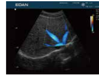
Superb color Doppler spatial resolution aids in rapid interrogation of the hepatic veins