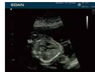
Evaluation of the fetal heart demands exquisite detail resolution