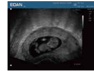
Excellent contrast and detail resolution are demonstrated in this first trimester OB endovaginal image