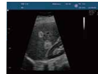
Spatial compounding and speckle reduction enhance contrast resolution to clearly delineate hepatic lesions