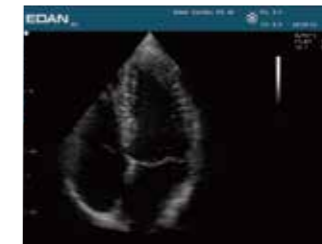
Harmonic imaging produces excellent myocardial border definition.