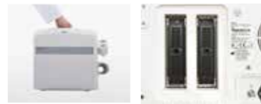
Two Transducer connectors, active and exchangeable.

Whether your imaging study requires unparalleled detail and contrast resolution for high frequency musculoskeletal imaging or superb penetration to evaluate deep abdominal targets, the suite of transducer optimized for the U50 Prime Edition ultrasound system ensures you can scan more patients, across more applications, with more diagnostic confidence. Characterized by a compact, lightweight design and user-centric workflow, the U50 Prime Edition meets the need for a highly portable and easy-to-use ultrasound system.