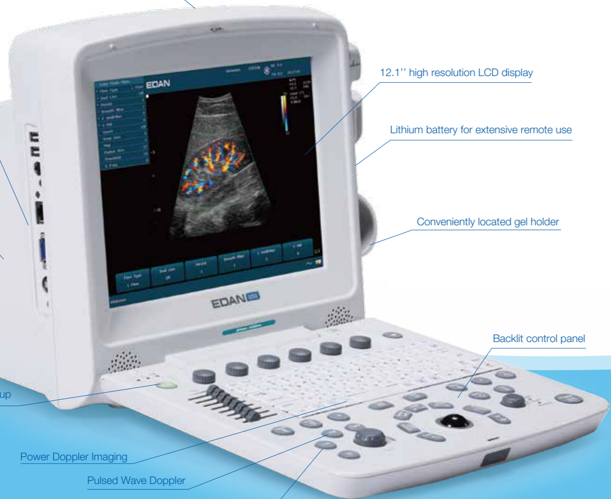
12.1" high resolution LCD display